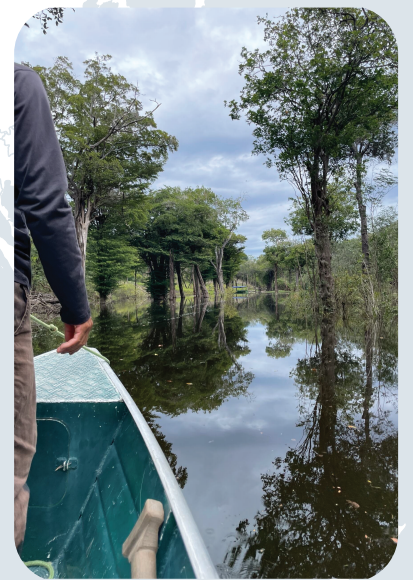
Copaiba Harvesting in Brazil

In 2019, the Healing Hands Foundation funded a dental clinic for